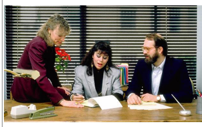
Drug abusers are 1/3 less productive, using twice as much sick leave.

The NSDUH is an annual survey of civilian, non-institutionalized population of the U.S. aged 12 years or older and is the primary source of statistical information on substance use and abuse by the U.S. population.