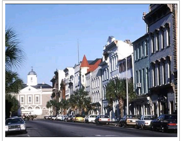
Port cities like Charleston are especially susceptible to illegal drug traffic

The study's findings indicate that the vast majority of drug users work. Of the 16.6 million illicit drug users aged 18 or older in 2002, 12.4 million (74.6 percent) were employed either full or part time. In addition, most individuals classified with substance dependence or abuse were employed either full or part time.