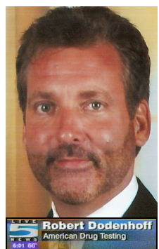
The Drug-Free Workplace Advisor is published by American Drug Testing, a leading drug-free

For additional information, see the “client area” at www.AmericanDrugTesting.net or call 843-747-4111.